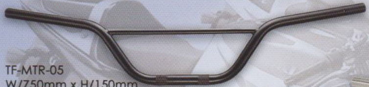
TF-MTR-05 W/750mm x H/150mm Material: alloy or steel