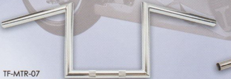
TF-MTR-07 W/500mm~1000mm H/200mm~500mm Material: steel or crmo