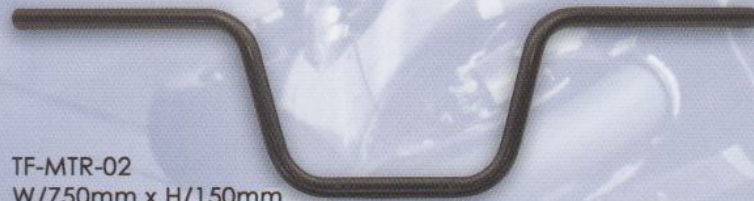
TF-MTR-02 W/750mm x H/150mm Material: alloy or steel