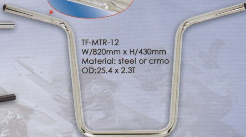
TF-MTR-12 W/820mm x H/430mm Material: steel or crmo OD:25.4 x 2.3T