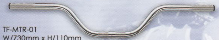
TF-MTR-01 W/730mm x H/110mm Material: alloy or steel