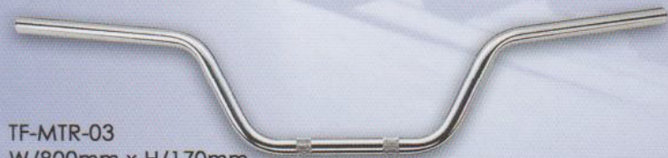
TF-MTR-03 W/800mm x H/170mm Material: alloy or steel