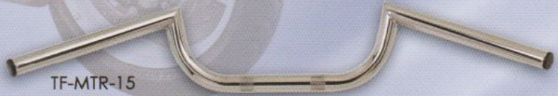
TF-MTR-15 W/690mm x H/100mm Material: steel or crmo OD:25.4 x 2.3T