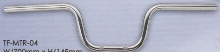
TF-MTR-04 W/700mm x H/145mm Material: alloy or steel