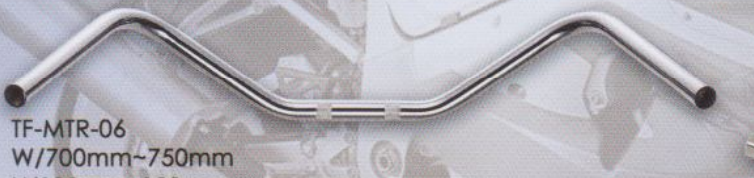
TF-MTR-06 W/700mm~750mm H/100mm~120mm Material : alloy or steel