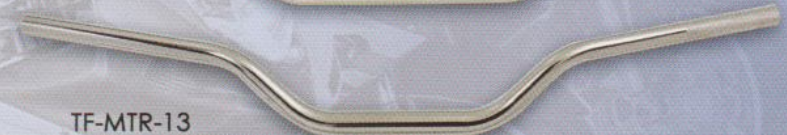
TF-MTR-13 W/780mm x H/100mm Material: steel or alloy